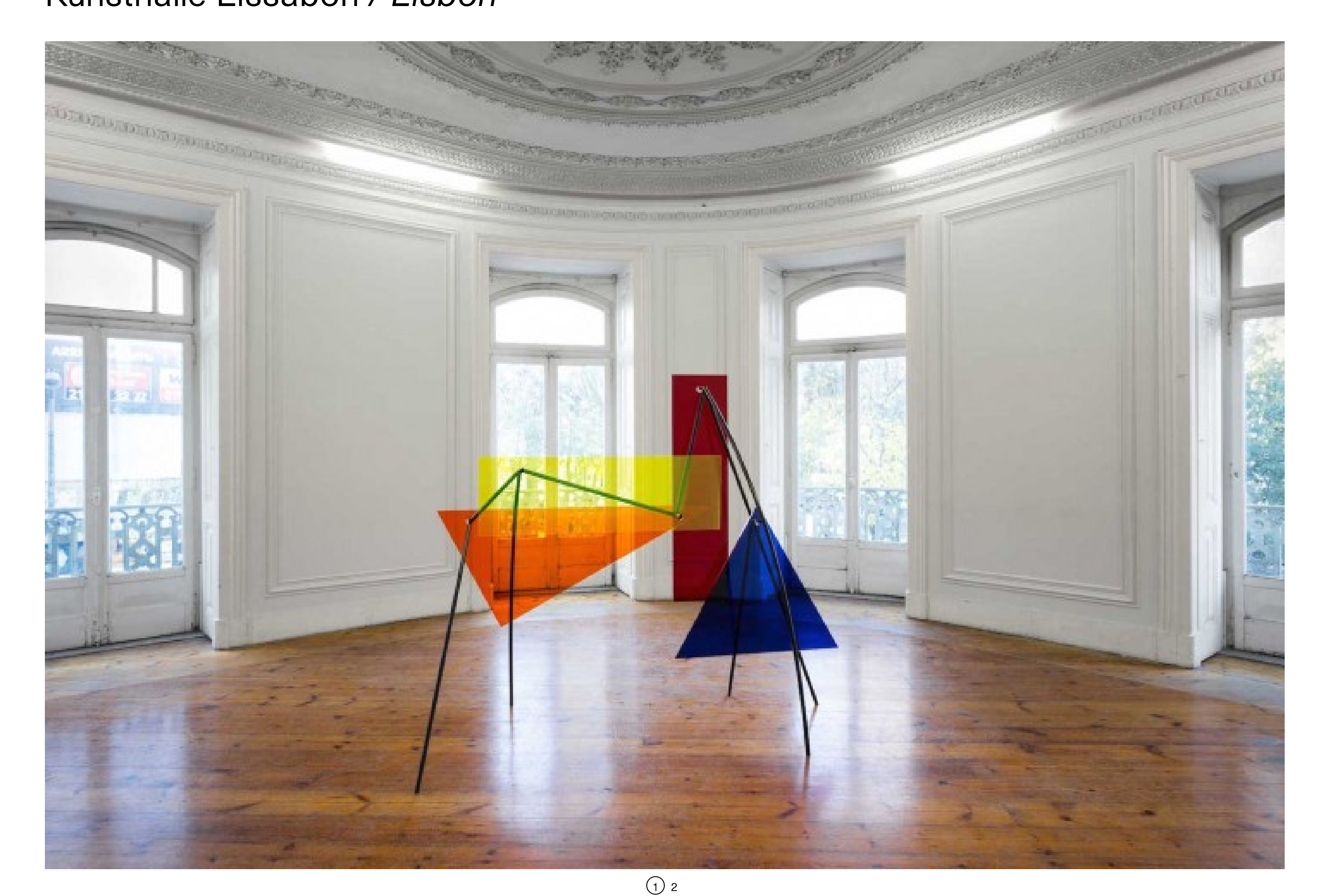
Amalia Pica, "Memorial for Intersections" installation view at Kunsthalle Lissabon.

Kunsthalle Lissabon (KL) is one of the few solid independent institutions in Lisbon's contemporary art scene. Persevering through a climate of cultural stagnation, its program has been running at a steady pace, and KL has just moved to a new location in east Lisbon.